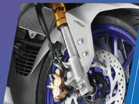
Golden Color Brake Caliper