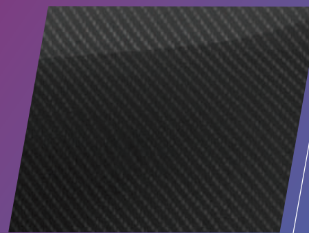
NEW CARBON FIBRE PATTERN (*Standard on R15M)