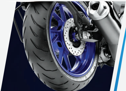
Super Wide 140 mm Radial Rear Tyre