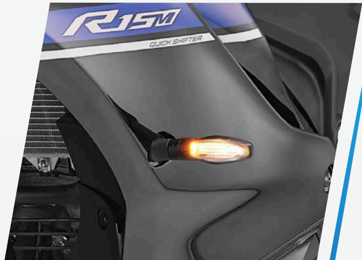
LED Flashers* (*Standard on R15M)