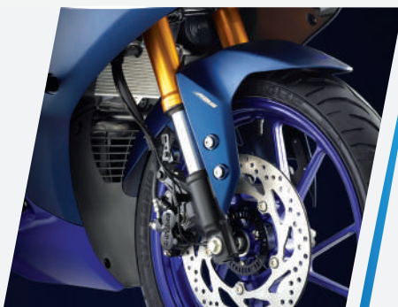
Upside Down Front Forks