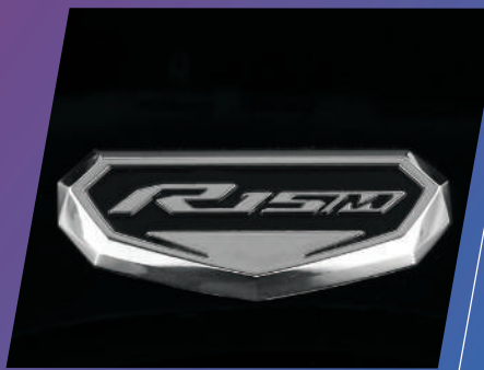
R15M 3D Logo