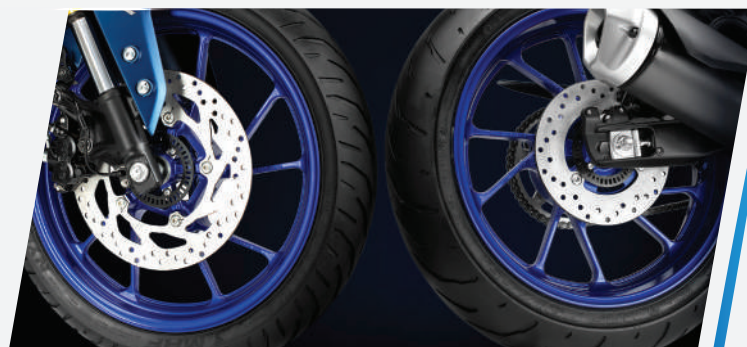
Dual Channel ABS